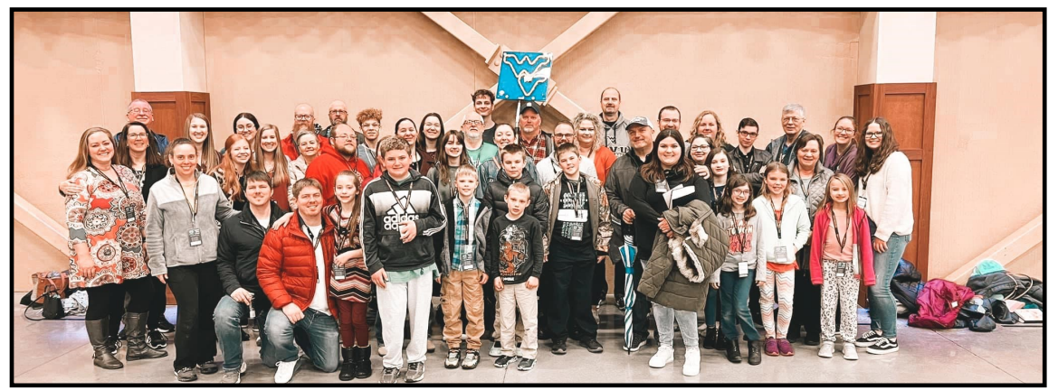
CAMDEN AVENUE 2022 CYC GROUP

Care Group 2- Spaghetti Noodles Care Group 4- Spam