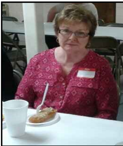
Jo, what kind of donut is that?