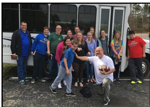
Stark County Youth Rally pictures from last weekend.

If you would like to make a monetary donation to help send students to the LLL convention, please see Todd Kirk or Bill Mills.