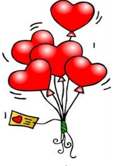
Thank You Notes