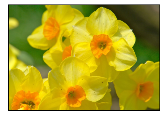
Encourage one another and build each other up. I Thessalonians 5:11

Bible Study......11:00 PM Worship......6:00 <u>Wednesday</u> Bible Study......7:00PM